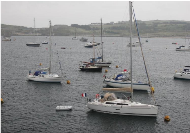
Black Jack centre in Braye Harbour.

Mid-morning Wednesday we slipped the mooring bound back to Braye Harbour, Alderney. A lovely sail was had, arriving at the race as planned, attaining 13 knots over the ground and popping out the other end like a cork.