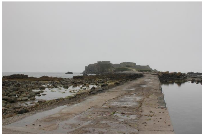
An eerie Fort Clonque

Saturday we spent exploring the whole island. Deserted beaches and WW2 fortifications a plenty, Alderney is stunning with its wide open landscapes, green pastures, turquoise seas, and rugged cliffs. An abundance of wild flowers but no sighting of any famous Alderney blonde hedgehogs. During our 11 mile walk we also took advantage of a good view of the infamous Alderney Race from the zigzag track above Fort Clonque. This being part of our course to follow the next day. Something we knew we had to time right.